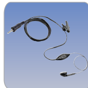
VC-27 Ear piece / Microphone