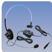
VC-24 VOX Headset