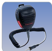
CMP460 Noise Cancelling Waterproof Speaker/Microphone