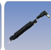
E-DC-6 12V Cable Without Adapter Plug