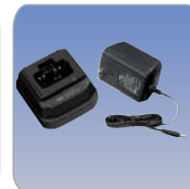
VAC-370C 230 VAC Rapid Charger